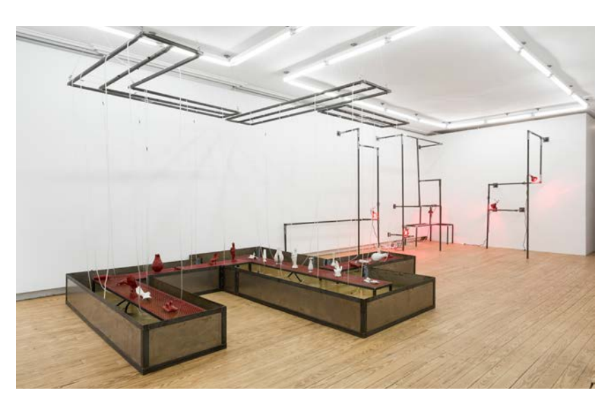
Begin in smoke, End in ashes, 2019 (detail at left, installation view above). Steel, slip cast, enamel spray paint, water, slow-drip irrigation system.

The artist's structure also houses a two-channel video mapping chemical compounds of the various ingredients