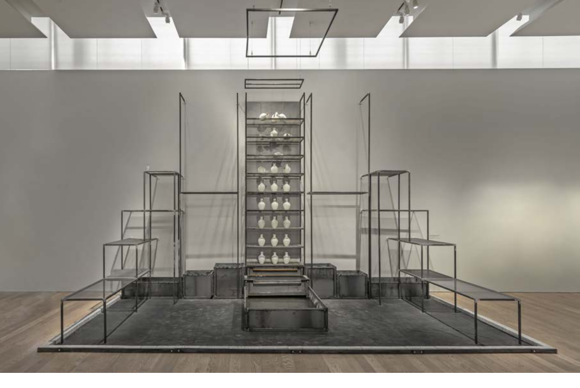
Measure of one, 2020. Installation view: RAW, Gardiner Museum, Toronto, 2020.

that comprise bukhoor incense. A sort of digital recipe, the video's 3-D scans of the topographies of eerily floating mounds of frankincense and other fragrant resins also allude to historical trade networks. Ancient Nubia's premier exports to pharaonic Egypt were the aromatics used in ceremonies "connected to the inseparable realms of religion and politics," which intricately linked them with displays of state power.<sup>3</sup> El Siddique summons these entangled histories in illustrations welded onto the installation architecture. Formed by a metallurgic alchemy of concentrated applications of heat and gas (she employs a combination of MIG and TIG welding techniques to render loose, expressive sketches on polished stainless steel panels), her drawings include pictorial homages to precious aromatic resins and their