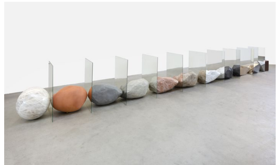
Trans-For-Men 11 (Fibonacci) , 2019.

CNC milled from various natural stones and Berg crystal, each piece is derived from 3-D scans of the original boulder. This data is entered into an algorithm based on the so-called "golden ratio" of the Fibonacci sequence (in which each number is the sum