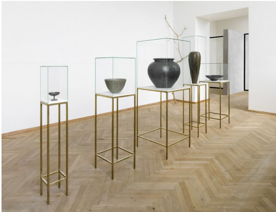
Out of Ousia , 2018. Installation view, Kunsthall Charlottenborg, 2018.