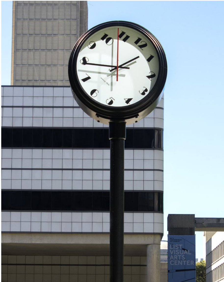
Against the Run , 2019.

Zeitzone ( Time Zones ), Kwade questions the basis of metrics that index and quantify time, addressing the peculiar bureaucracies that maintain their global standardization. Time zones, for instance, are strategically hewn along national borders and economic zones to advantage industrial production.