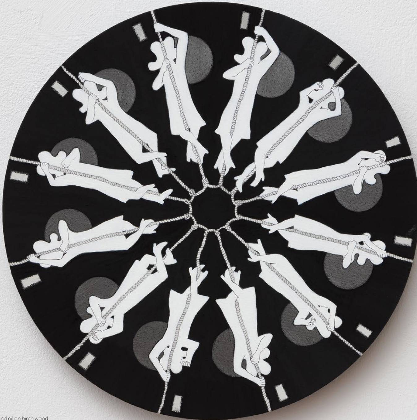
Reign of the Idle Hands #1, 2019 Graphite, charcoal, pastel, ink, acrylic, and oil on birch wood 12 in. (30.5 cm) diameter