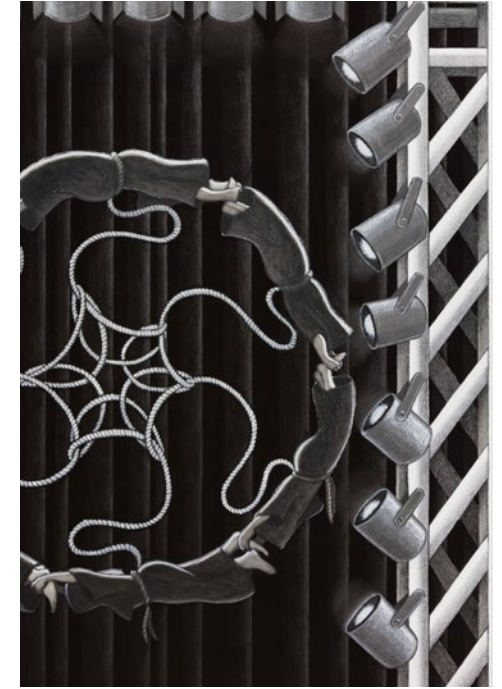
Yearnings of the Flesh , 2019 (detail) Graphite, charcoal, pastel, ink, acrylic, and oil on canvas 84 × 64 in. (213.3 × 162.6 cm)

source materials for additional meanings. Circles and wheels, for instance, are found throughout Kim's recent work and integrate references to illusory vision and to fate. Reign of the Idle Hands #1 (2019) [cover image] belongs to a series of round paintings informed by the phénakistoscope, an early animation disc that when rotated around a central axis gives the illusion of movement to the images drawn on its surface. In these works, Kim disables the kinetic apparatus central to its concept. Instead, the painting is stable, and bears the repeated form of Madame Earth in frustrated attempts to scale a rope—each illustration a fragment of what, if activated, would be a cohesive motion. Echoing this design on a larger canvas, Yearnings of the Flesh (2019) features a circular procession of cloaked and rope-bound schoolgirls who spookily float, ouroboros-like, within an arbor formed by a theatrical lighting rig. Found in Medieval illuminated manuscripts like the Carmina