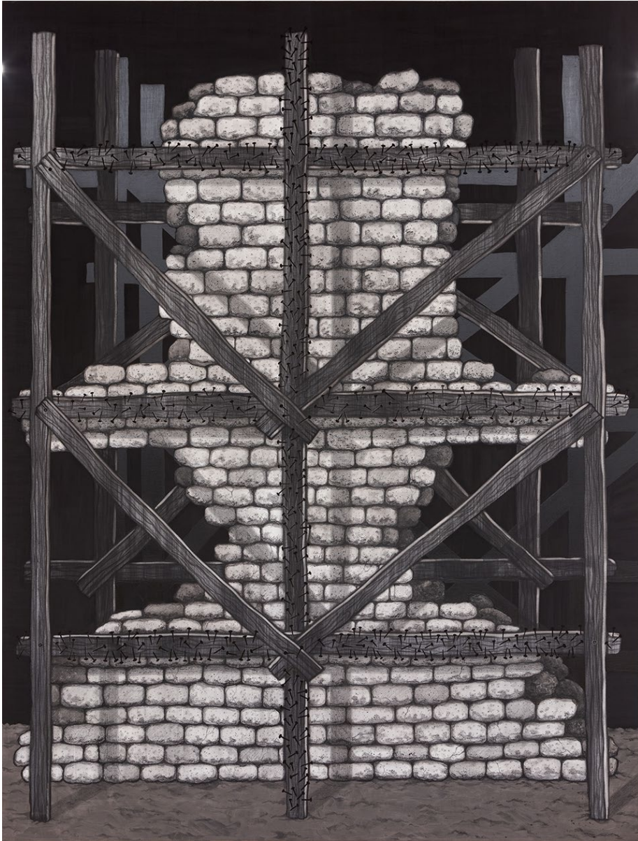
Mister Capital , 2019 (front view of double-sided work) Oil, acrylic, ink, pastel, graphite, charcoal on canvas and birch 84 × 64 in. (213.3 × 162.6 cm)

source materials for additional meanings. Circles and wheels, for instance, are found throughout Kim's recent work and integrate references to illusory vision and to fate. Reign of the Idle Hands #1 (2019) [cover image] belongs to a series of round paintings informed by the phénakistoscope, an early animation disc that when rotated around a central axis gives the illusion of movement to the images drawn on its surface. In these works, Kim disables the kinetic apparatus central to its concept. Instead, the painting is stable, and bears the repeated form of Madame Earth in frustrated attempts to scale a rope—each illustration a fragment of what, if activated, would be a cohesive motion. Echoing this design on a larger canvas, Yearnings of the Flesh (2019) features a circular procession of cloaked and rope-bound schoolgirls who spookily float, ouroboros-like, within an arbor formed by a theatrical lighting rig. Found in Medieval illuminated manuscripts like the Carmina