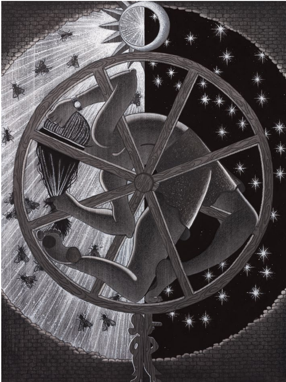
8 Hours of Slumber, Labor & Leisure, 2020 Oil, acrylic, ink, graphite, charcoal on canvas and birch 64 × 48 in. (213.3 × 162.6 cm), double sided