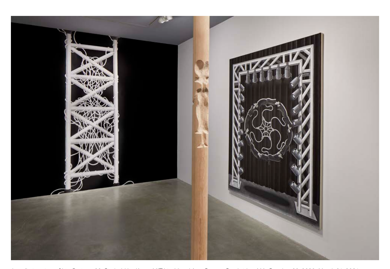
Installation\ view\ of\ \textit{List Projects 22: Cindy Ji Hye Kim}\ at\ MIT\ List\ Visual\ Arts\ Center,\ Cambridge,\ MA,\ October\ 29,\ 2020-March\ 21,\ 2021.

Employing the same materials that constitute the support structures of her paintings, Kim's sculptures engage the gallery architecture to delineate and discipline the corpus of the space itself, while furthering the self-contained iconographic system through which the allegorical content of her works unfolds. In Iron Nerve (2020) [detail, at left] steel cable and screw eyes form the laces of a corset as if constraining the waist of the wall, while The Body Sins Once (2020) [below, foreground] is comprised of a hemlock wood dowel etched with a relief of Madame Earth and held in tension between floor and ceiling. As Kim's works exhaust the spatial possibilities of the painting object and the flat and bounded picture plane, they also engage visible architectures as analogues for unseen structures of power, intimating that one's subjection to such forces is both integral and by design.