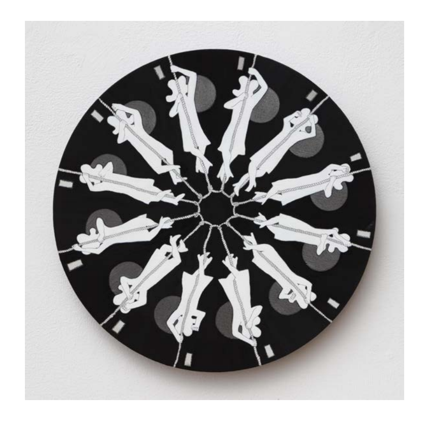
Reign of the Idle Hands #1, 2019 Graphite, charcoal, pastel, ink, acrylic, and oil on birch wood, 12 in. (30.5 cm) diameter Collection of Rahul Sabhnani, New York

gruesome subjects probe the body's relationship to architectures of power, while articulating formal and conceptual relationships between the content of her images and the technical limitations of two-dimensional representation.